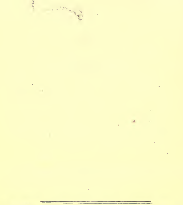
J. M'CREERY, Printer, Black-Horse-Court, Fleet-Street, London.